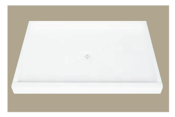
One piece, single threshold model for recessed installation. Features 1" flange on three remaining sides. Center drain.