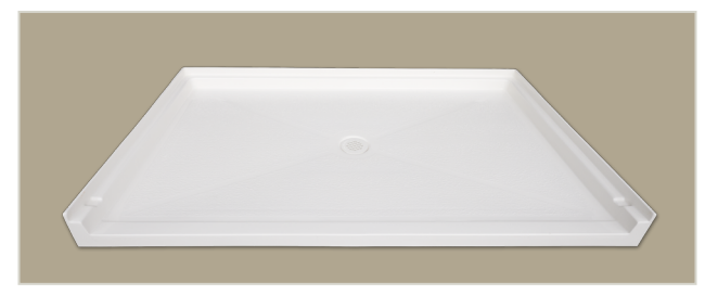
One piece, single threshold model for recessed installation. Features 1" flange on three remaining sides.