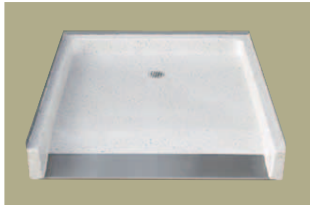
Model 500 Barrier free Terrazzo Shower Receptors with built-in stainless steel ramp.

Offset drain. Additional flanges. (Drawings required)