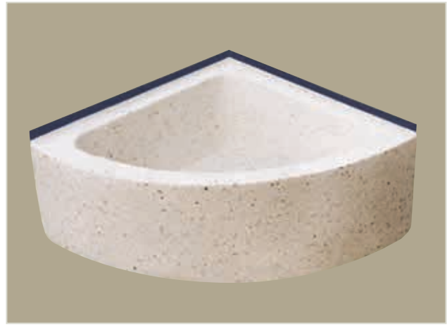
Shown: Model 97

FLORESTONE PRODUCTS CO., INC. 2851 Falcon Drive • Madera, CA 93637 T. 559.661.4171 • T. 800.446.8827 F. 559.661.2070 • florestone.com