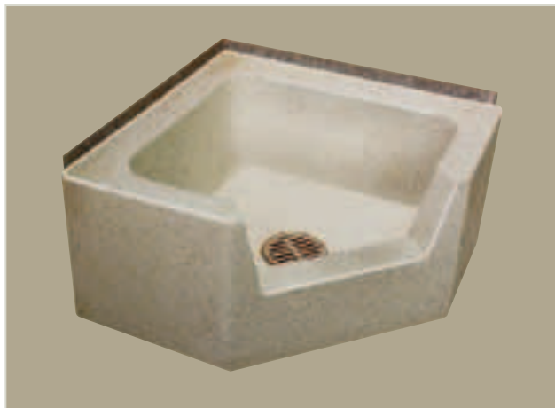
Shown: Model 95