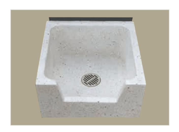
Shown: Model 90