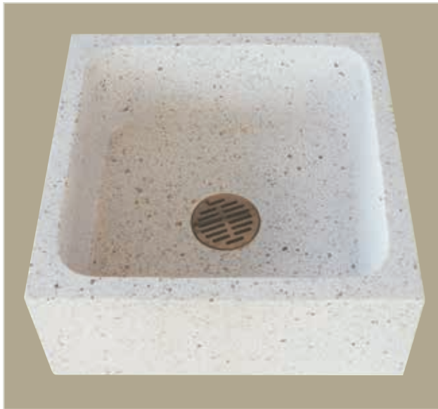
Shown: Model 5