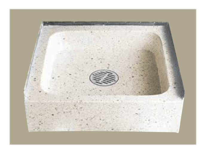
Shown: Model 40

2851 Falcon Drive • Madera, CA 93637 T. 559.661.4171 • T. 800.446.8827 F. 559.661.2070 • florestone.com