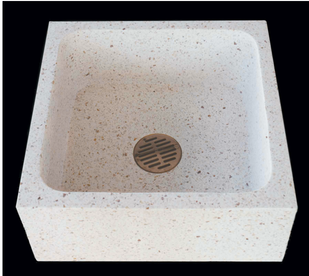
Shown: Model 5