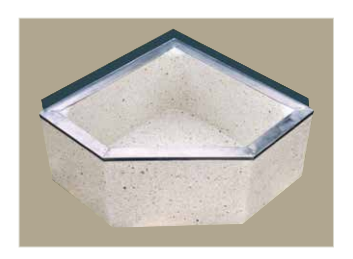
Shown: Model 87